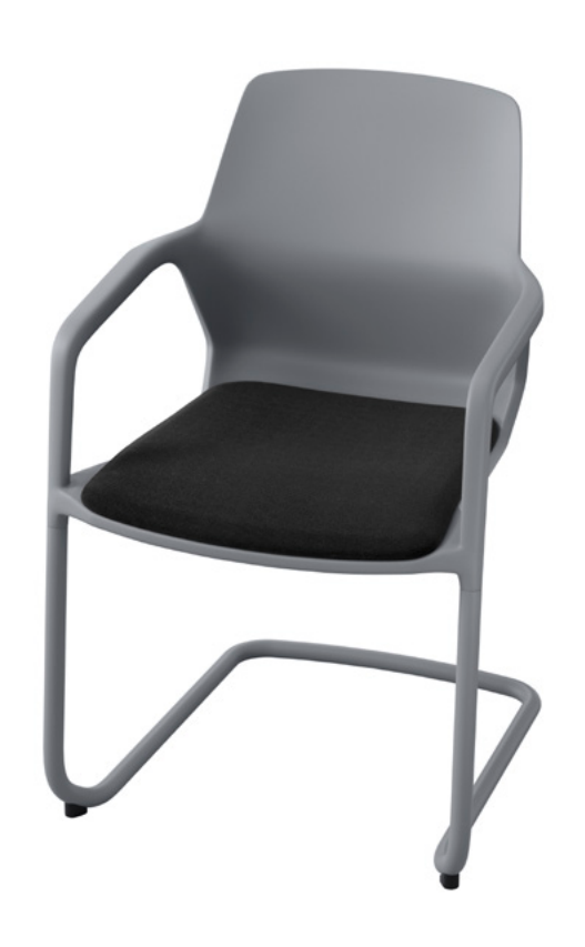
186/3 Cantilever chair with seat and back cushion