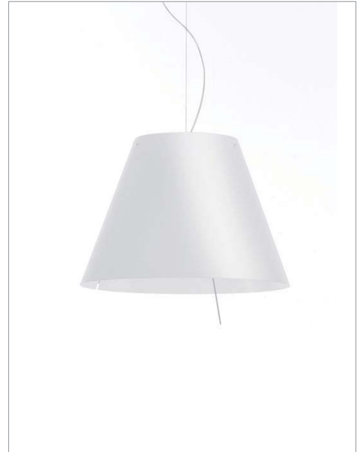
D13G s. (dimmer)