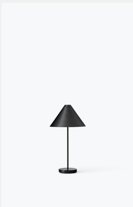
Variant Steel Black Item No 21511 EAN No 5712826215111