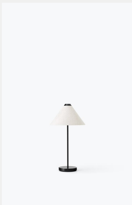
Variant Linen Item No 21510 EAN No 5712826215104