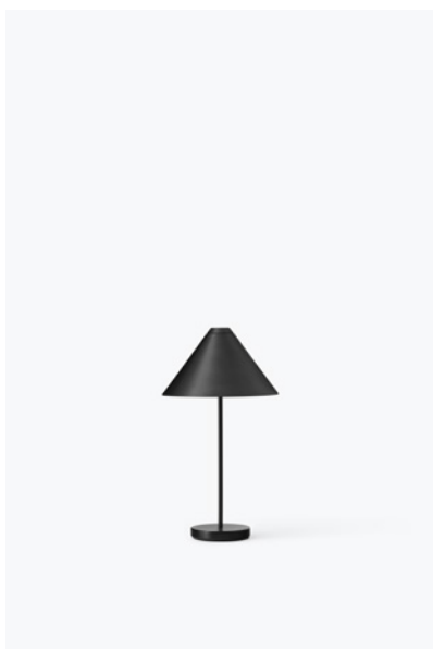
Brolly Portable Table Lamp Steel Black