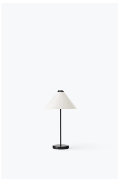
Brolly Portable Table Lamp Linen