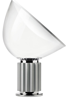
Table lamp providing indirect and reflected light. Reflector in painted aluminium, gloss white on the outside and matt white on the inside.. Directionable diffuser in transparent mouth-blown glass. Body in matt black. silver anodized or bronze anodized aluminium. Base in nickel-plated metal. Electric cable of useful length 220 cm, with dimmer switch for ON/OFF and adjustment of the light flow between 10-100%. Plug-in power supply with interchangeable plugs.

by Achille & Pier Giacomo Castiglioni , 1962