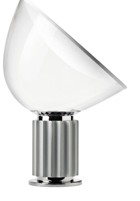
Table lamp providing indirect and reflected light. Reflector in painted aluminium, gloss white on the outside and matt white on the inside. Directionable diffuser in transparent PMMA. Body in matt black or naturally anodized extruded aluminium. Base in nickel-plated metal. Electric cable of useful length 220 cm, with dimmer switch for ON/OFF and adjustment of the light flow between 10-100%. Plug-in power supply with interchangeable plugs.

by Achille & Pier Giacomo Castiglioni , 1962