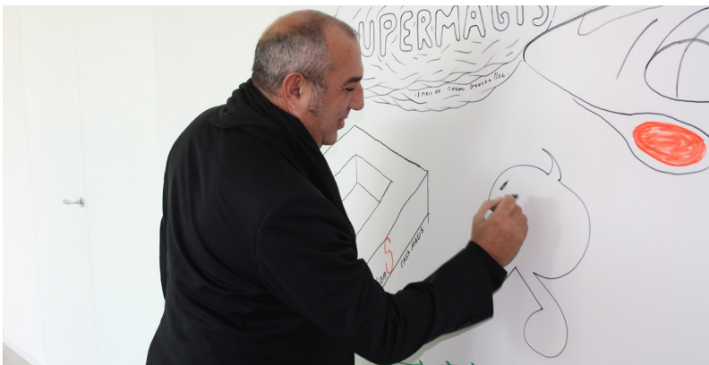
Designer in Magis

Both the chair and the table fit well both in a modern and in a classical furniture and are suitable both for domestic and contract market.