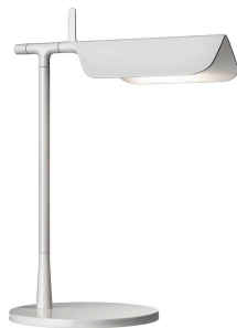
Table lamp. Body in painted pressofused aluminium. Multi-led diffuser in specially designed PMMA to avoid the Multi Shadow effect and dazzle. Head rotation \pm 45^\circ .