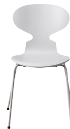
NEW COLOUR PALE GREY COLOURED ASH