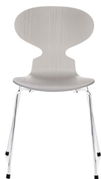
NEW PRICE NINE GREY* COLOURED ASH