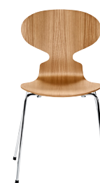
NEW PRICE ELM NATURAL VENEER