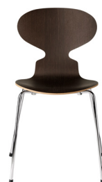
NEW PRICE DARK STAINED OAK NATURAL VENEER