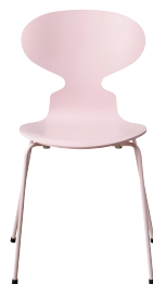
NEW COLOUR PALE PINK COLOURED ASH