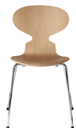
NEW PRICE OAK NATURAL VENEER