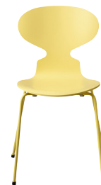
NEW COLOUR PALE YELLOW COLOURED ASH