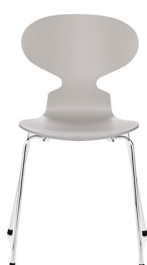
NINE GREY* LACQUERED