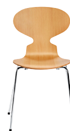
NEW PRICE OREGON PINE NATURAL VENEER