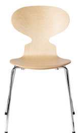
NEW PRICE MAPLE NATURAL VENEER