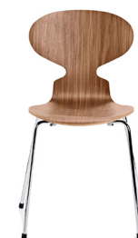
NEW PRICE WALNUT NATURAL VENEER