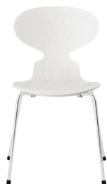
NEW PRICE WHITE COLOURED ASH