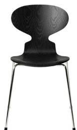
NEW PRICE BLACK COLOURED ASH

All shell variations come with classic chromed steel legs. Chairs in 3 new colours can be made with matching legs in powder coated steel. A printed version of Ant™ is also available. See 'Ant™ Deco Silhouette' on the Partner Portal.