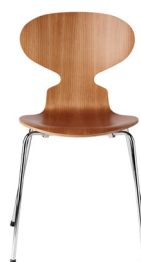
NEW PRICE CHERRY NATURAL VENEER