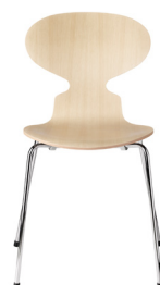
NEW PRICE ASH NATURAL VENEER