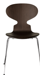
NEW PRICE FULL DARK STAINED OAK NATURAL VENEER