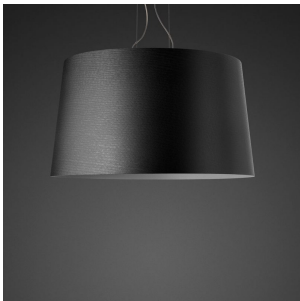
Twice as Twiggy