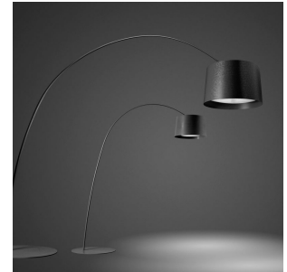
Twice as Twiggy