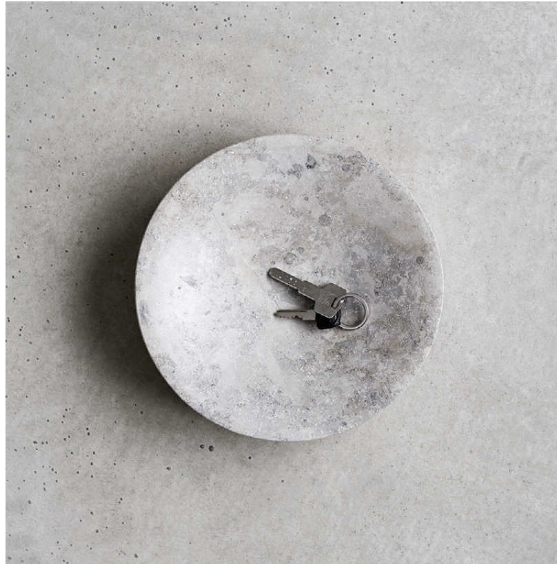
A structure to hold your clothes and everyday objects. With the stone bowl in the lower position, it becomes a rain water collector for wet umbrellas.